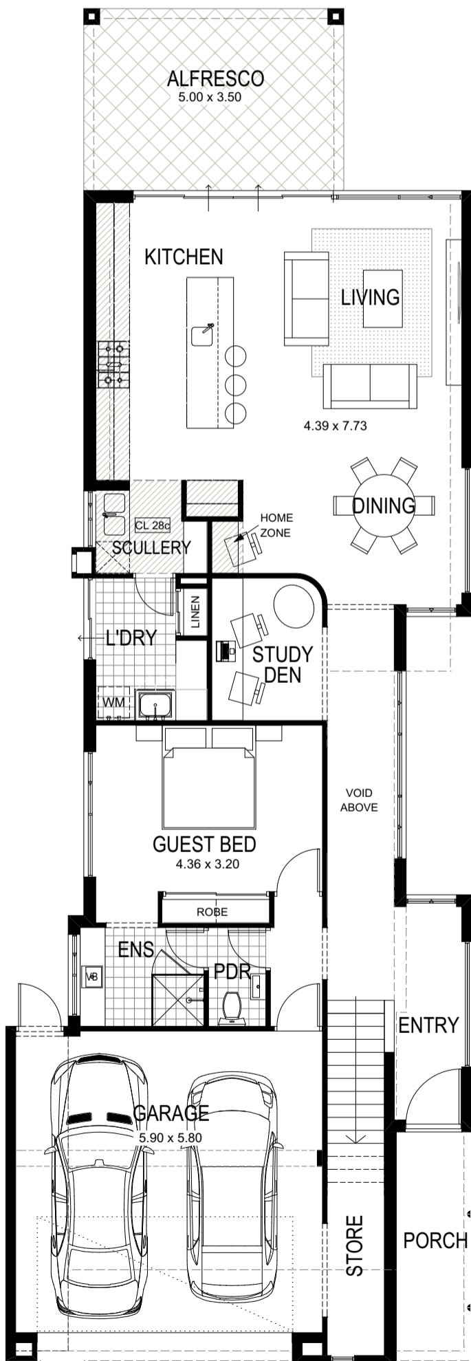
GROUND STOREY PLAN 1:100