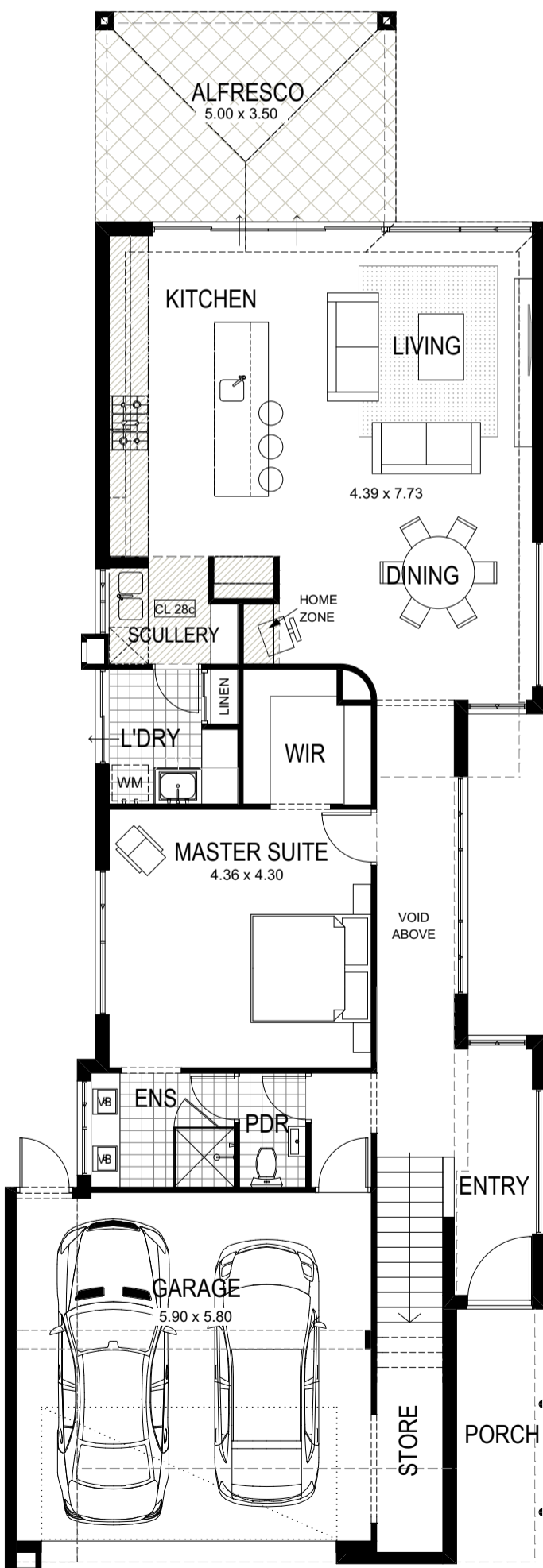
GROUND STOREY PLAN 1:100